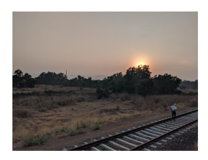
On our way to Dervan

The next few days started with initial orientation around the enormous grounds of the B.K.L. Walalkar Memorial hospital and education centre. As the hospital had been built in an underdeveloped area, brilliant education facilities were established to help support the families of staff committed to working there. The hospital itself is a hub of activity with people waiting in corridors to be reviewed by doctors or nurses in huge open wards. The theatre complex is cleverly laid out to include separate theatres for orthopaedics, obstetrics, general surgery and Urology with a well-staffed recovery and facilities for staff to change and take breaks in, all separated from the main hospital to minimise any contamination from the outside into the operating theatres.