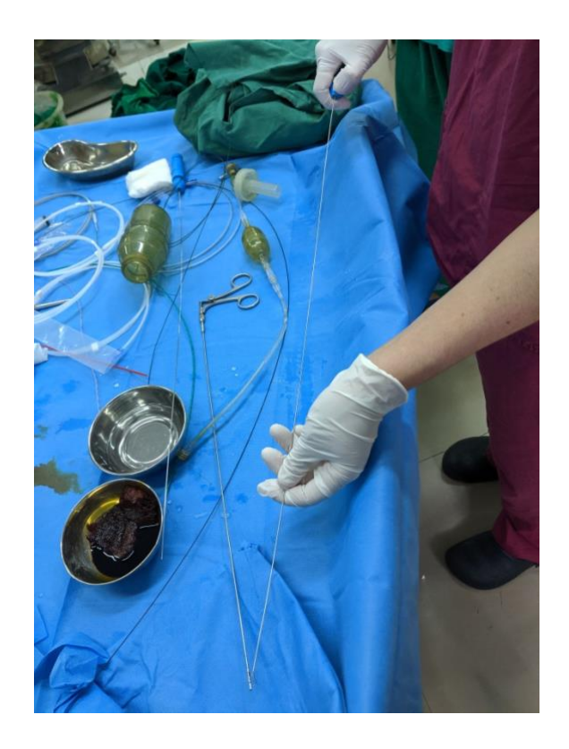
Looking after endoscopic kit

Our role as the team of visiting Urologists was to clear the backlog of urological cases that had built over recent months as, with Dervan being so remote, the nearest Urologist was based 8 hours away in Mumbai. There had previously been a visiting Urologist from Mumbai who would come every few months, but not enough to manage all the patients fully. The patients would have ended up using a great deal of their savings to get to Mumbai for expensive stone treatment if it weren't for the camp and the work done by the Walawalkar Hospital and they were very grateful for the work done by the well-established U.K. camp team.