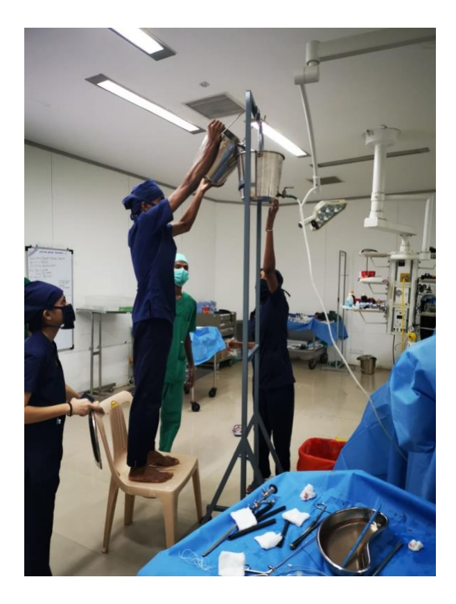
Sorting out irrigation in theatre

An intriguing aspect of the time I spent in Dervan was observing the post-operative recovery of patients that almost always had doting family members at the bedside, ready to help their loved ones with mobilising, washing and eating post operatively. The nurses were fantastic at encouraging the patients and their family members to work at recovering and getting out of hospital. This dynamic allowed for very effective medical care by freeing up the nurses to be a more active part of multi-disciplinary team looking after the patient.