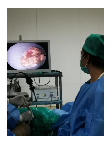
CT of stones and PCNL in progress

The next days of operating were busy with back-to-back cases of complex stones requiring ureteroscopy and lithoclast or PCNL, TURPs, TURBTs, urethral strictures requiring dilation, a large hydrocele and a chronically infected kidney for which the patient required open nephrectomy. The stone disease in these patients was noticeably different from in the U.K. The stones were often sizeable and, in many cases, PCNL was more appropriate for a shorter, more thorough operation. These decisions were often made after reviewing imaging alongside the Radiologist on site. For PCNL, the Urology team would form their own tract under USS guidance and the patients recovered well from the procedure, mostly leaving the hospital within 2 days after post-operative antibiotics and blood tests. I loved working in this environment where the Urology is essentially the same but all the equipment is slightly more out-dated. It was a reminder of how Urological practice has become so wonderfully advanced and of how we take for granted even simple things such as continuous irrigation during endoscopic procedures!